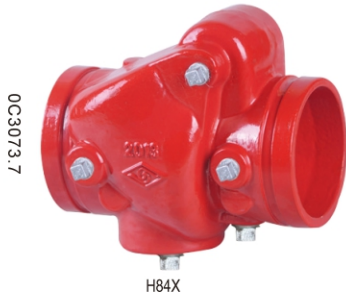
Fig. No. H84X & H84XF4