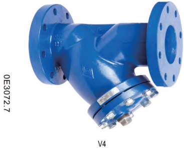
Fig. No. V4